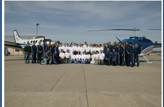
Flight School Graduating Class